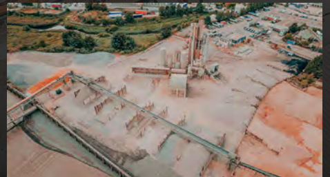
* Maintained & Serviced - Concrete Facilities